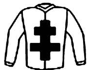
Cross of Lorraine