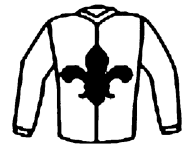
Fleur de Lis