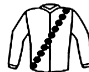
Triple Spot Band